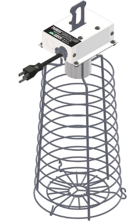
Grounded NEMA L5-15 Male Plug