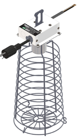
NEMA 120V or 277V (L5-15P or L7-15P) Twist-Lock Plug with Romex Cable for Hard Wiring