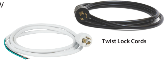
Twist Lock Cords

Built to the NEMA Standard, this locking power cord plug is rated for 120V or 277V circuits, has a fully molded low profile ergonomic shape, and is RoHS compliant. The plug body is molded with deeply contoured ridges and a non-slip grip that makes "plug-in" quick and easy.