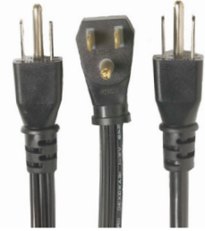
Power/Appliance Replacement Cords

Meets the requirements of the 2023 National Electrical Code: Articles 422.16(A)(1) and (2).