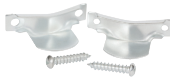
Strain Relief Clamp