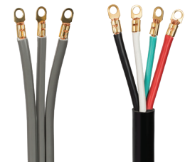
Heavy-Duty Ring Terminals