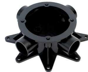
SPIDERBOX™ with Glue-in Hubs (3/4" Hubs) (P/N: 15248)