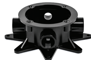
SPIDERBOX™ with Glue-in Hubs (1/2" Hubs) (P/N: 15245)