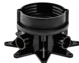
SPIDERBOX™ with Glue-in Hubs and Adapter (3/4" Hubs) (P/N: 15248-ADAPTER)