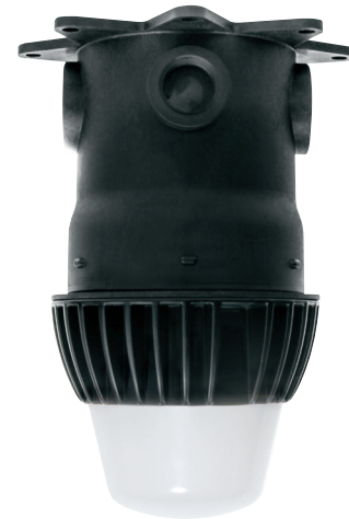
ProSeries LED Utility Luminaire (P/N: 15913)