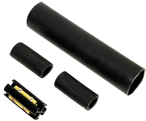
EV Charging Cable Splice Kit Part Number: EVSK-1