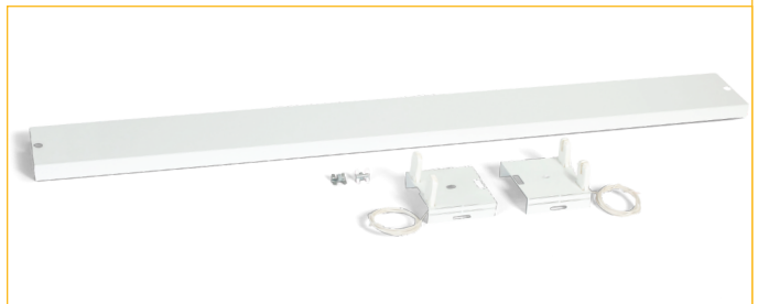
4 Foot Bundled Fixture Bracket Kit