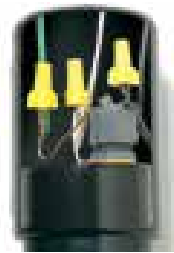
Landscape SplicePost Cap Cut-Away