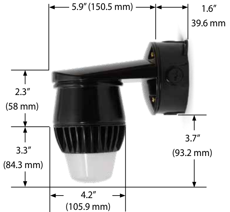
P/N 15931: ProSeries Elite Wall Mount LED Utility Luminaire