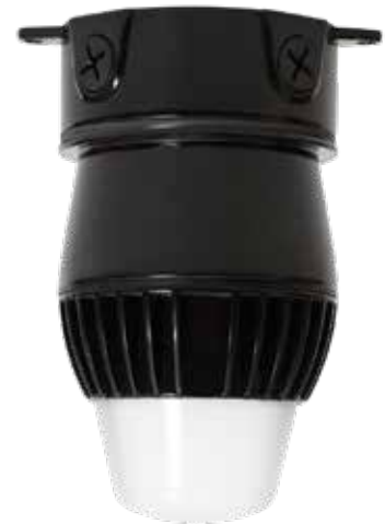
ProSeries Elite Ceiling/Pendant Mount