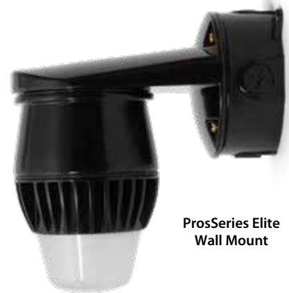
ProSeries Elite Wall Mount