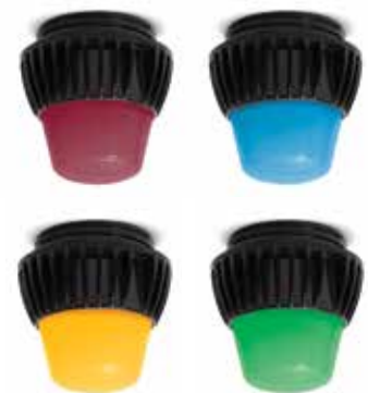
Available with Red, Blue, Amber, and Green Lenses (See Page 2)