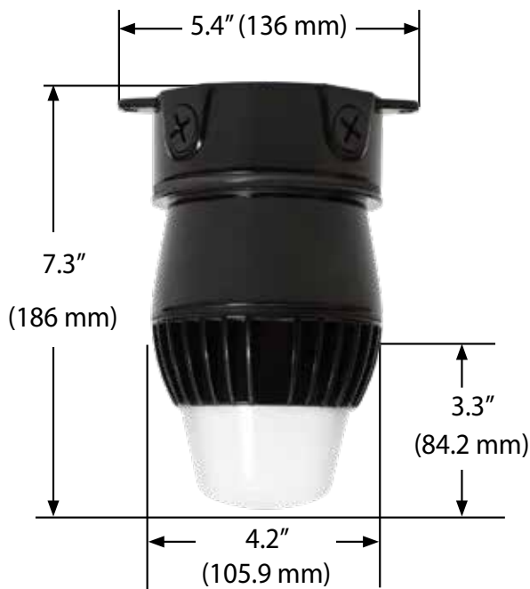
P/N 15930: ProSeries Elite Ceiling/Pendant Mount LED Utility Luminaire