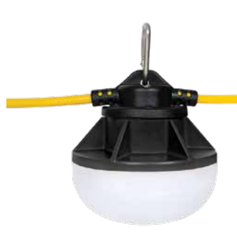
LED CordLights (High Lumen Output) Part Number: 16050